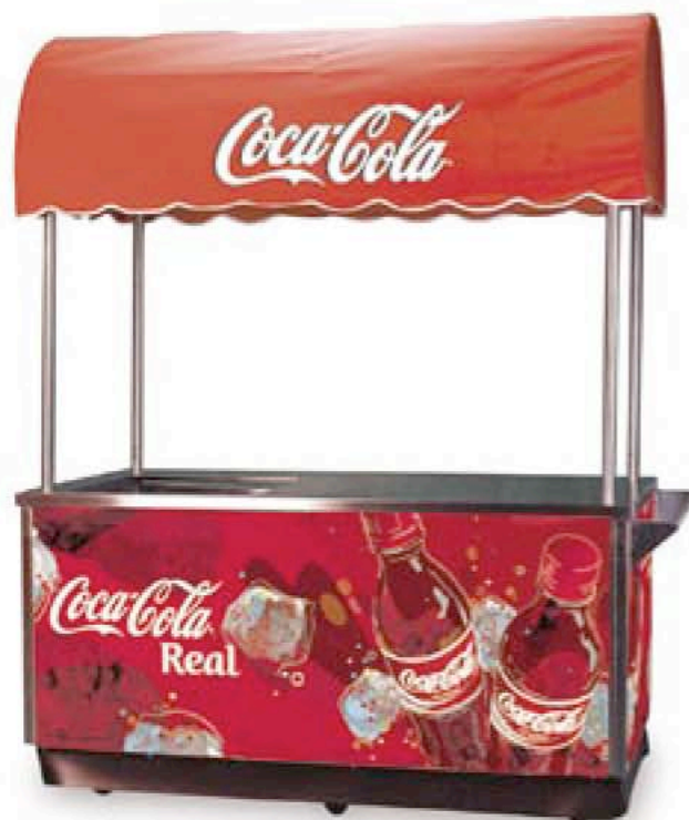
Post-Mix Beverage Carts shown with custom awning and graphic panels.