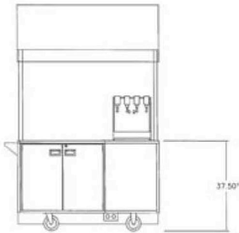
OPERATOR'S SIDE VIEW