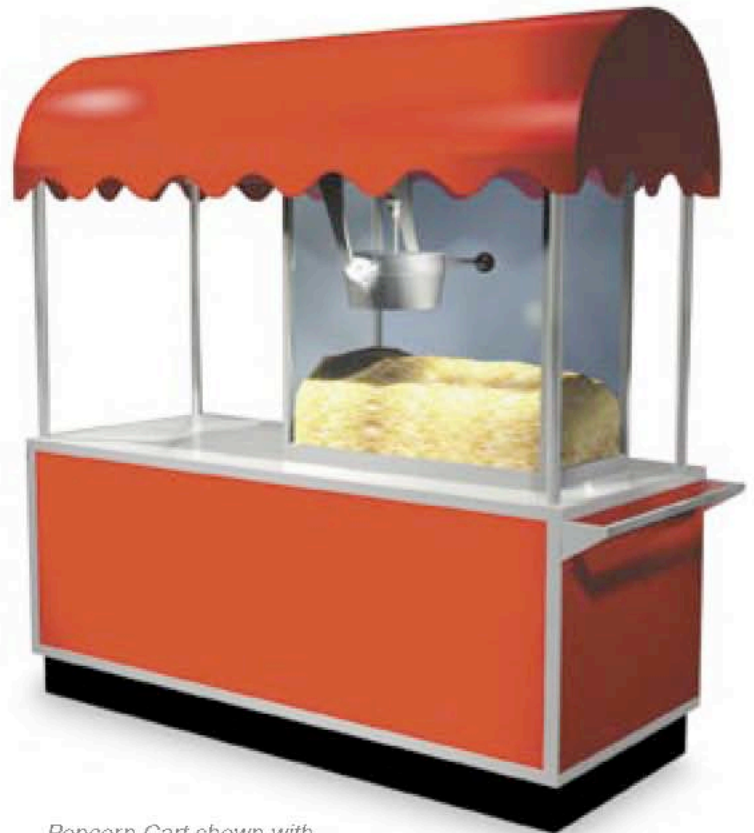
Popcorn Cart shown with standard awning and laminate panel. Custom awning and graphics available.