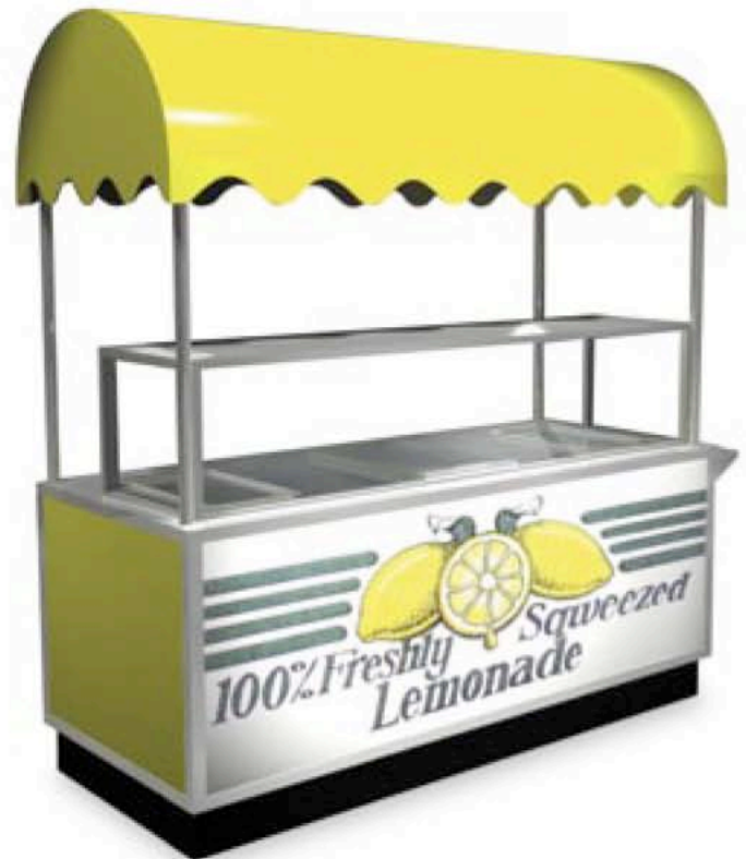
Lemonade Cart shown with standard awning and custom graphics panel. Custom awning available.