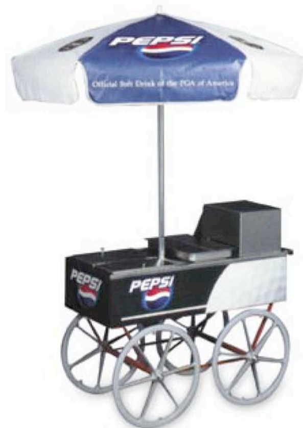
Hot Food Cart shown with custom umbrella and graphics.